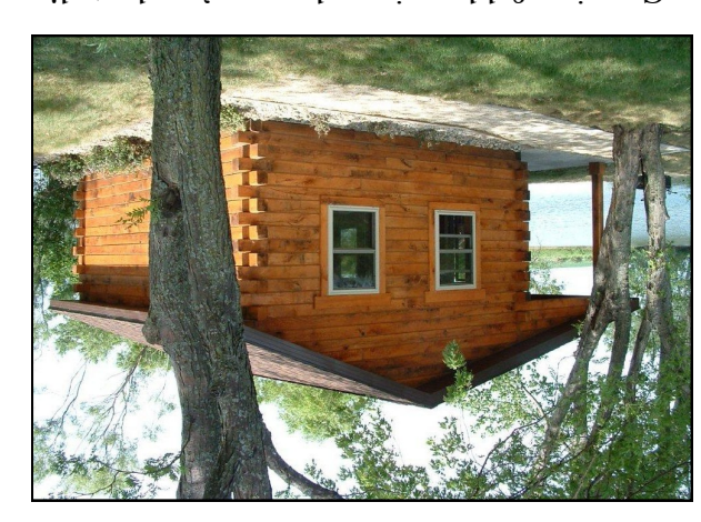
sleeping cabin at Meredith Park near Plover. Center and Rosenberger Park or reserve the north edge of Pocahontas. Stop by our Nature PCCB's headquarters are on Hwy. 4 on the