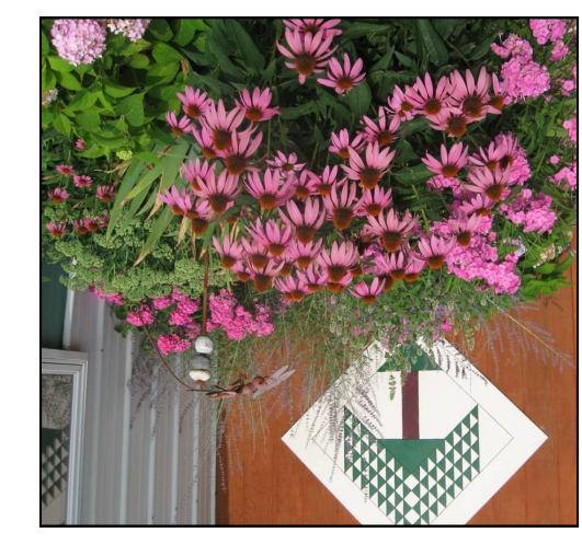
Growing & blooming where we're planted!